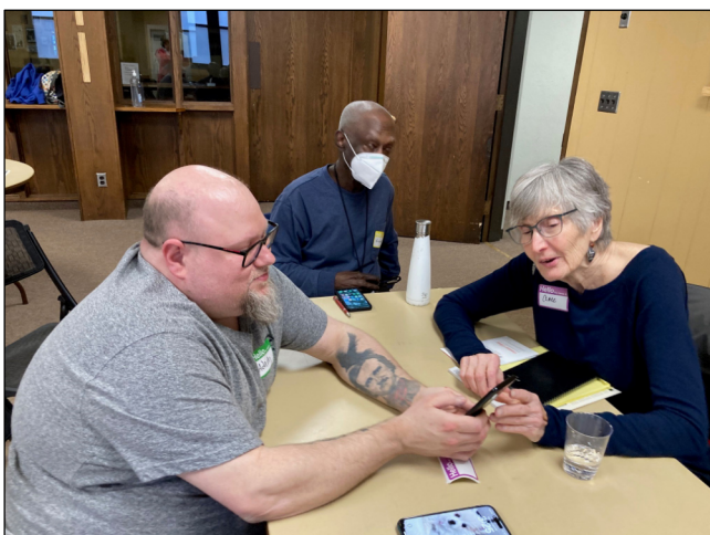
Volunteers and clients at a technology clinic