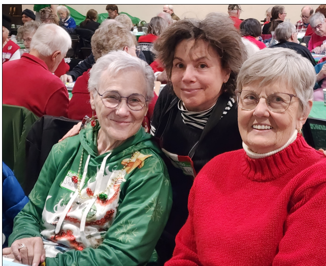
Guests enjoying the 2024 LSHS Holiday Party. We can't wait to see you for this year's celebration!