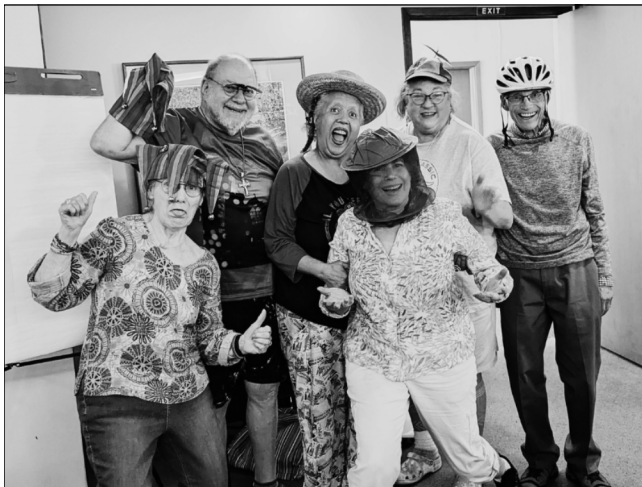
Goofing around at the LSHS Volunteer Appreciation Celebration